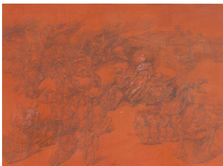
Werner Tübke, Happening mit Verkündigung, 1981 Graphite on red prepared paper 50 x 68 cm Kunstsammlung der Berliner Volksbank K 32 © VG Bild-Kunst, Bonn 2024