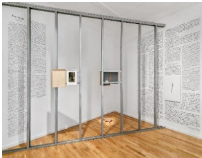
Exhibition view "Durchdringen: Das U/unheimliche s/Sehen" (Inter/Penetration: The Uncanniness of Seeing), Stiftung Kunstforum Berliner Volksbank