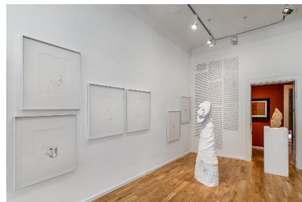
Exhibition view "Durchdringen: Das U/unheimliche s/Sehen" (Inter/Penetration: The Uncanniness of Seeing), Stiftung Kunstforum Berliner Volksbank (Werner Tübke), Nachlass Ingeborg Hunzinger