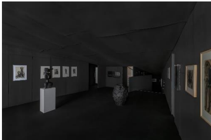
Exhibition view "Durchdringen: Das U/unheimliche s/Sehen" (Inter/Penetration: The Uncanniness of Seeing), Stiftung Kunstforum Berliner Volksbank © VG Bild-Kunst, Bonn 2024 (Max Uhlig, René Graetz, Armando) © Studio Michael Müller, Berlin, Hirschvogel

The images can be downloaded for current reporting on the internet at https://kunstforum.berlin/en/press-photos-durchdringen-das-unheimliche-sehen/ . The photos are protected by copyright and may only be used for articles about the exhibition until a maximum of four weeks after the end of the exhibition, i.e. until 12 January 2025. Please also note that the images may not be altered or manipulated. Please publish photographic material with the appropriate source and copyright information. If you require image files in other formats or resolutions, please contact us.