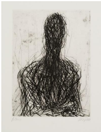
Max Uhlig, Bildnis (aus der Mappe: Zeichnen für den Druck), 1978/79 Etching on handmade paper 66 x 46 cm Kunstsammlung der Berliner Volksbank K 325 © VG Bild-Kunst, Bonn 2024