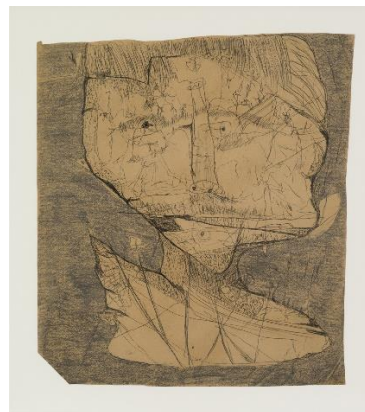
Gerhard Altenbourg, Kopf, 1961 Pitt crayon and graphite on brown wrapping paper 89 x 79,5 cm Kunstsammlung der Berliner Volksbank K 258 © VG Bild-Kunst, Bonn 2024