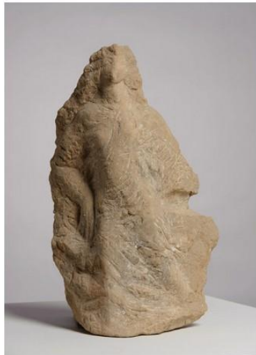
Ingeborg Hunzinger, Im Wind, 1986 Sandstone 43 x 26 x 16 cm Kunstsammlung der Berliner Volksbank K 1026 © Nachlass Ingeborg Hunzinger