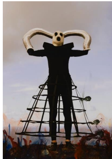
Cornelia Schleime, Ein Sommer, der mir aus der Hand fällt, 2021 Painting over Fine Art Pigment Print on Hahnemühle Ultra Rag Paper 70 x 50 cm Kunstsammlung der Berliner Volksbank K 1525 © Cornelia Schleime